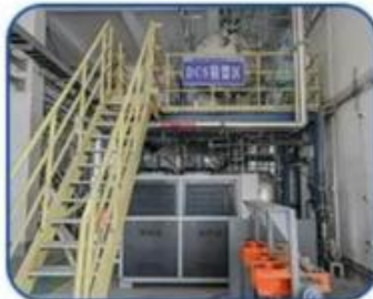
Zone of rectification