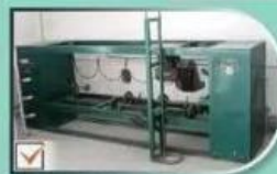
Inner Rust & Polish