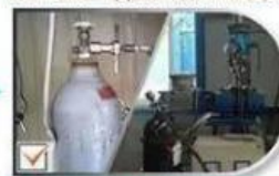
3. Vacuum & Drying 12 hours