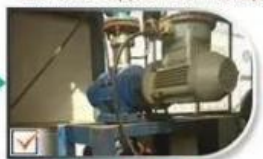
2. Tightness Inspect